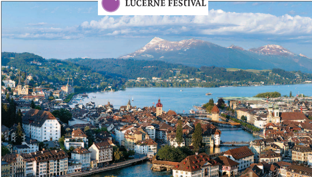
Lucerne and the Lake

“The fame of Lucerne as a tourist resort is kept up from year to year by a well-known music festival. The town has a remarkable site at the northwest end of Lake Lucerne.”