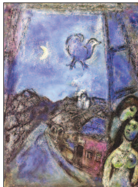
Chagall painting in the Rosengart Collection

Following a relaxing free day on Thursday, September 5th, we will hear the Orchestre de Paris at 7:30 pm. The Finnish-born conductor Klaus Mäkelä has announced a program of Tchaikovsky's Violin Concerto and Berlioz' Symphonie Fantastique . The Georgian violinist Lisa Batiashvili is the glamorous soloist for Tchaikovsky's demanding work.