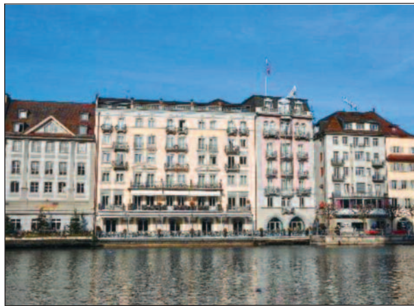
Hotel des Balances

Monday afternoon, September 2nd, an hour-and-a-half walking