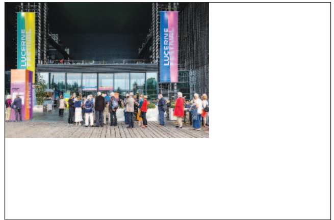
Konzerthaus at intermission