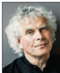
Sir Simon Rattle

Saturday, August 31st, departure from New York’s Kennedy Airport at 8:55 pm on Swiss Airlines flight #15, arriving in Zürich at 10:50 am