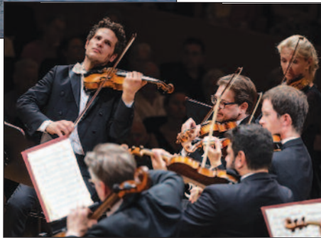
Lucerne Festival Orchestra

Sunday, September 8th, transfer to Zürich Airport in time for departure at 1:00 pm on Swiss Airlines flight #14, scheduled to arrive at New York's Kennedy Airport at 3:55 pm. Or independent departure.