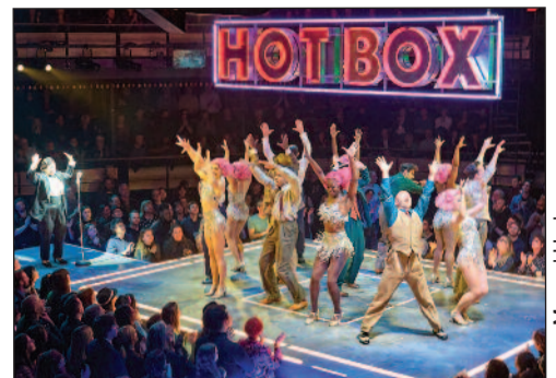
Nicholas Hytner's revival of Guys and Dolls

Thursday morning, June 6th, we have planned a leisurely 2-hour Walking Tour beginning at 10:30 am. The area around the Club and St. James's Square is rich with British history, dating back to the 17th century development of London's West End. Norfolk House in the Square was owned by the Astor family and was the headquarters