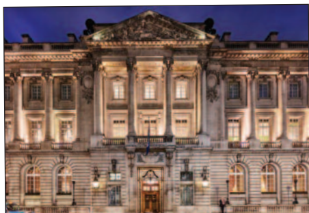
Royal Automobile Club

At 7:30 pm on Saturday evening, Music Director Sir Antonio Pappano will lead the forces of The Royal Opera in a performance of Umberto Giordano's Andrea Chénier . This sizzling music-drama of the French Revolution is famous for its dramatic arias and duets – Chénier's declamatory first-act 'Improvisato', the surging second-act love duet for the poet and Maddalena, the third-act trial by Robespierre's mock court with the show-stopping arias 'Nemico della patria' and 'La mamma morta', and the heroic final duet inspiring the lovers to choose the guillotine in defiance of tyranny. The sensational casting for the trio of principals will include German tenor Jonas Kaufmann as Chénier, American-Canadian