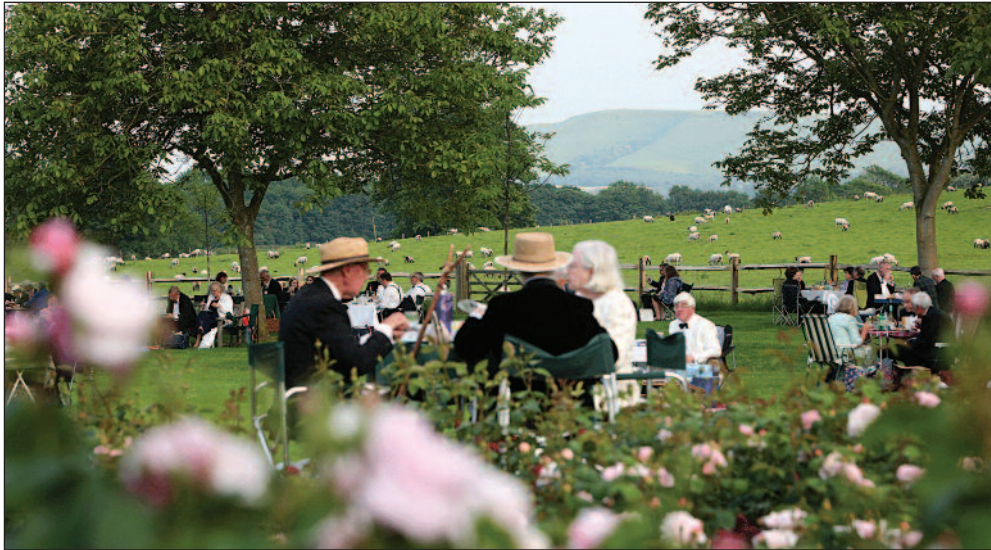
Glyndebourne Festival picnickers

Our 2023 London Spring Tour was quickly sold out, due to our private accommodations at the Royal Automobile Club , the Royal Opera's stellar performances, and our long overdue return to Glyndebourne. To repeat this experience in June of 2024, we look forward to Covent Garden for the season's highlight of Giordano's thrilling 'verismo' favorite, Andrea Chénier (with Jonas Kaufmann in the title role), and to Glyndebourne for an important new production of Bizet's Carmen . We will add a third operatic venue next year with Holland Park , where Puccini's Tosca will reflect this company's perennial success with the Italianate operatic tradition. A fourth event will be Guys and Dolls in "Nicholas Hytner's joyous production finding new depths in the classic Broadway musical" (NY Times).